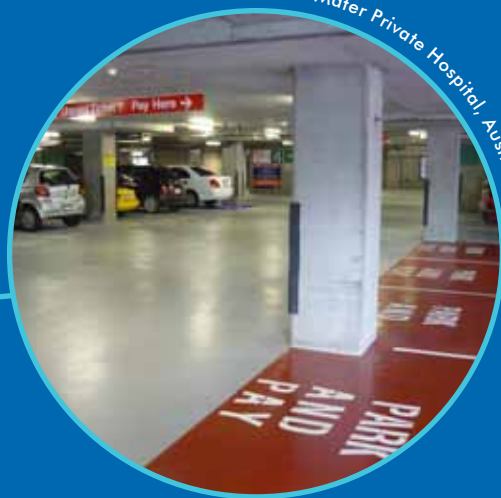
Mater Private Hospital, Australia.

The refurbishment was a great success with the work being completed to a high standard in a quick 14 day period.