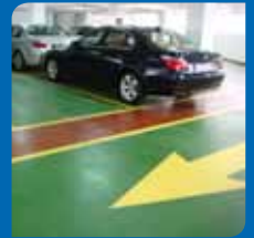
Multi-Storey Car Parks