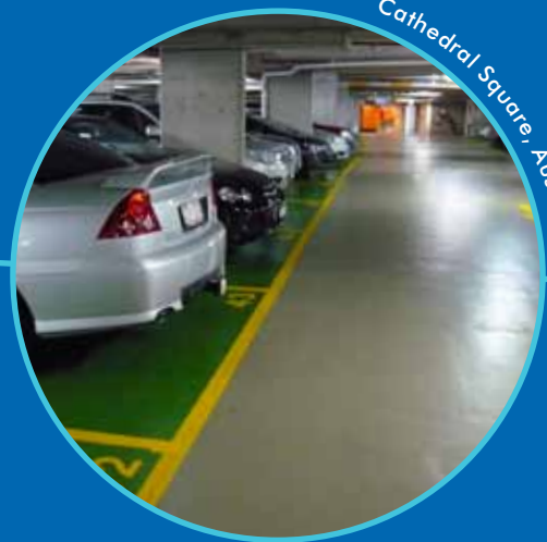
Cathedral Square, Australia.