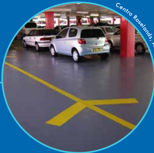
Centro Roselands, Australia.

Flowcrete's Deckshield was chosen for the refurbishment after 12 months of testing on site in the most trafficked area. Deckshield passed with flying colours with Centro commenting that the sample still looked brand new after testing. The 12,000m 2 project was completed in approximately 6 weeks.