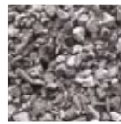
Grey Calcined Bauxite (PSV > 70)

This information is furnished without warranty, representation, inducement, or license of any kind, except that it is an accurate visual representation of the type of surfacing finish achievable using Antiskid Industries Pty Ltd products. All written information is accurate to the best of Antiskid Industries Pty Ltd's knowledge or has been obtained from sources believed by Antiskid Industries Pty Ltd to be accurate and hence Antiskid Industries Pty Ltd does not assume any legal responsibility for use or reliance upon same. Customers are encouraged to conduct their own tests and obtain data from sources, which they know to be reliable before using any product. Please note that colours may vary between printed sample and final product.