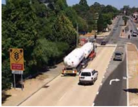
Improved Vehicle Deceleration