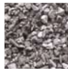
Grey Calcined Bauxite (PSV > 70)

This information is furnished without warranty, representation, inducement, or license of any kind, except that it is an accurate visual representation of the type of surfacing finish achievable using Antiskid Industries Pty Ltd products. All written information is accurate to the best of Antiskid Industries Pty Ltd's knowledge or has been obtained from sources believed by Antiskid Industries Pty Ltd to be accurate and hence Antiskid Industries Pty Ltd does not assume any legal responsibility for use or reliance upon same. Customers are encouraged to conduct their own tests and obtain data from sources, which they know to be reliable before using any product. Please note that colours may vary between printed sample and final product.