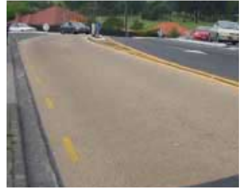
Proven accident reduction