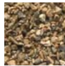
Buff Calcined Bauxite (PSV > 70)