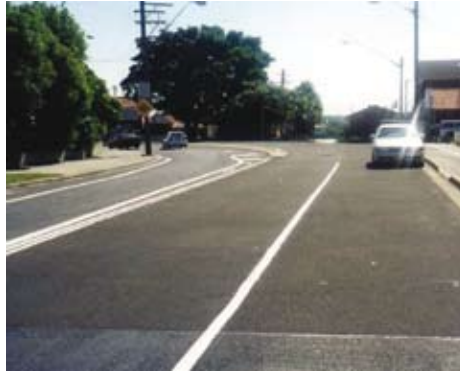
Reduction in threshold collision impact speeds