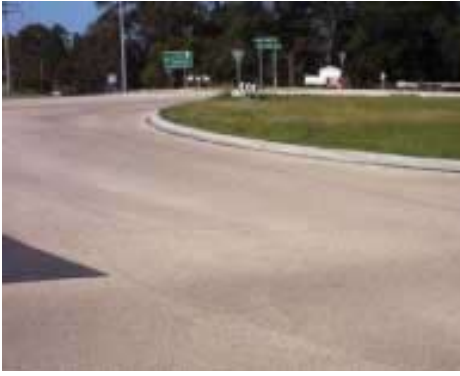
Highly effective for heavy use roundabouts