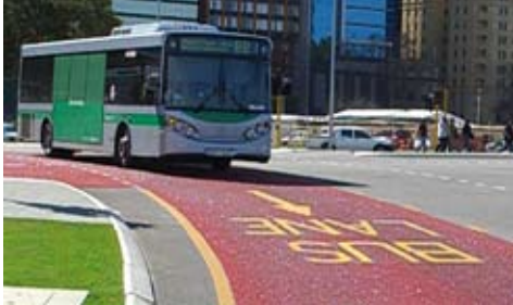
Ideal for Transit and Bus Lanes