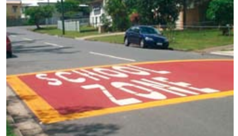
Ideal for School and Speed Zone Identification

OMNIGRIP CST is a durable, skid resistant coloured surfacing system comprised of thermosetting resin compound incorporating specialist synthetic coloured aggregates formulated for application to roads, highways and bridge pavements.