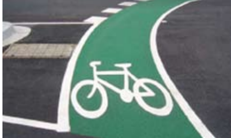
Improved visibility for Cycle Ways